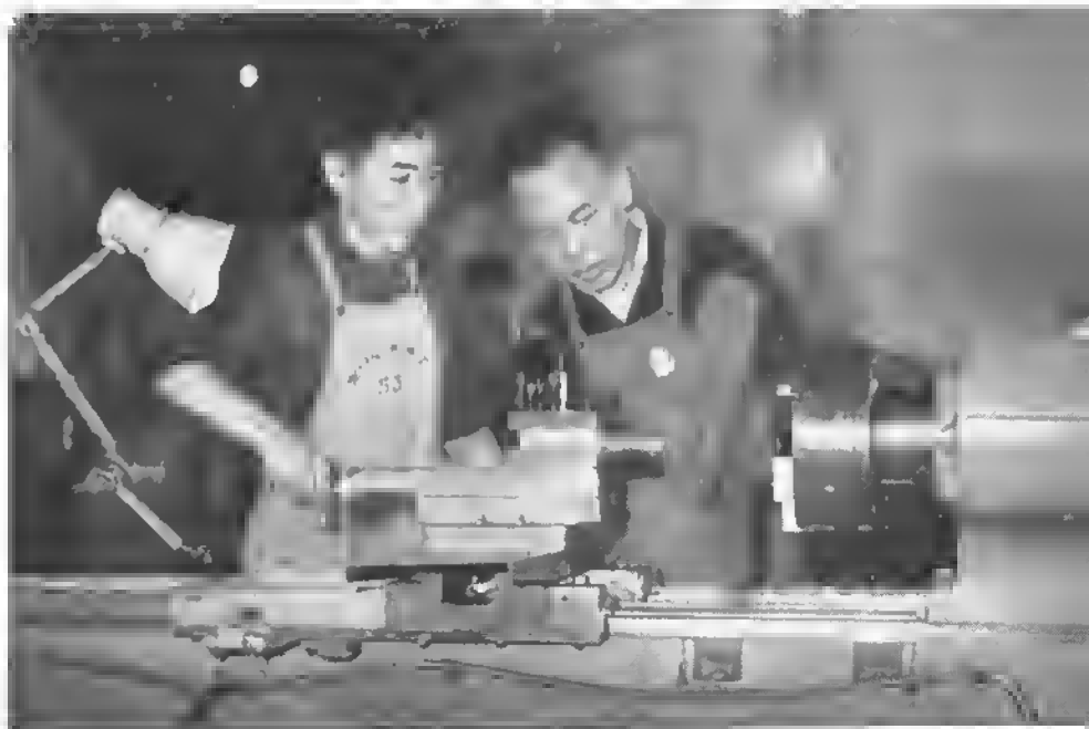
Drilling the axle hole on a Chinhua No. 1 runner, now being mass produced.

... The train sped on. Tang Teh-shui, watching new green fields recede rapidly, smiled the smile of the victor.